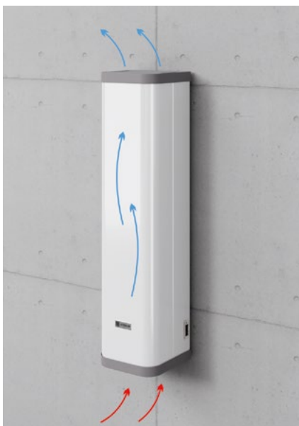
Airflow disinfection function

The design of the luminaire interior ensures perfect air flow and the highest level of disinfection efficiency. The UV-C Sterilon Air luminaire is equipped with protection against opening. Removing the top cover requires a hex key.