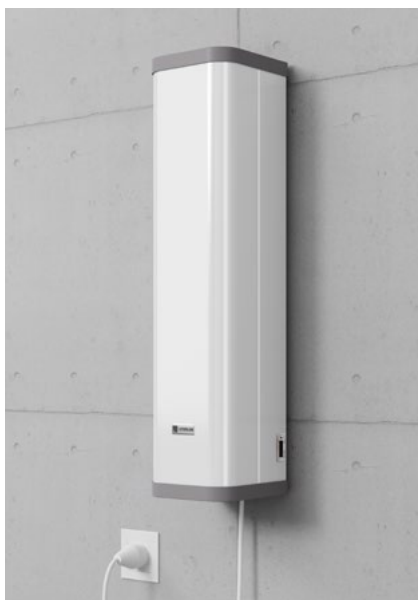
Version with cord (3 m)